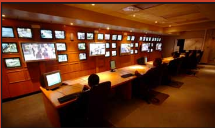
The Safe City CCTV control room