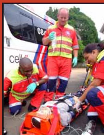
Responding to a c-SAFE call