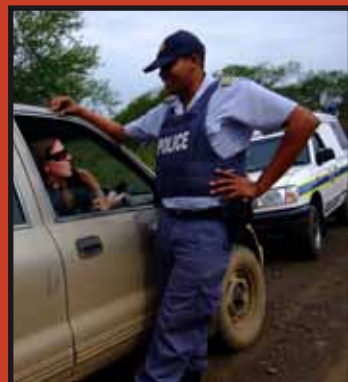
Police responding to a c-SAFE call.