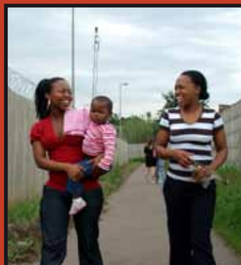
Walking safely through the city.