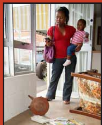
Calling for help from c-SAFE