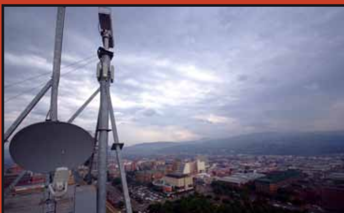
A Safe City camera watching over the whole of Pietermaritzburg.