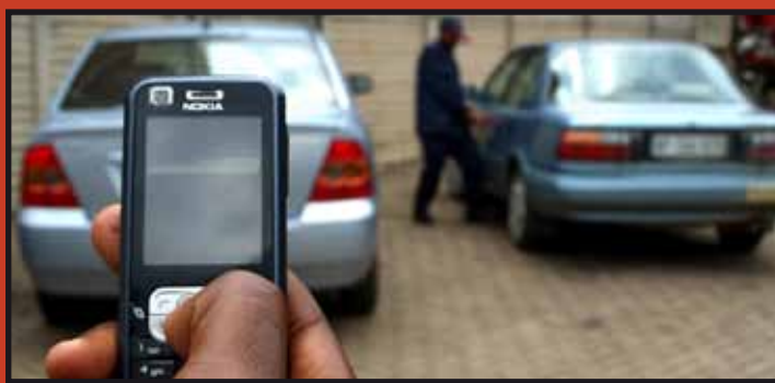
SMS being sent to Safe City reporting someone breaking into a car.