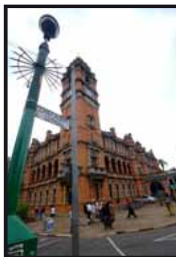
A Safe City camera

Future initiatives could include placing cameras in Edendale.